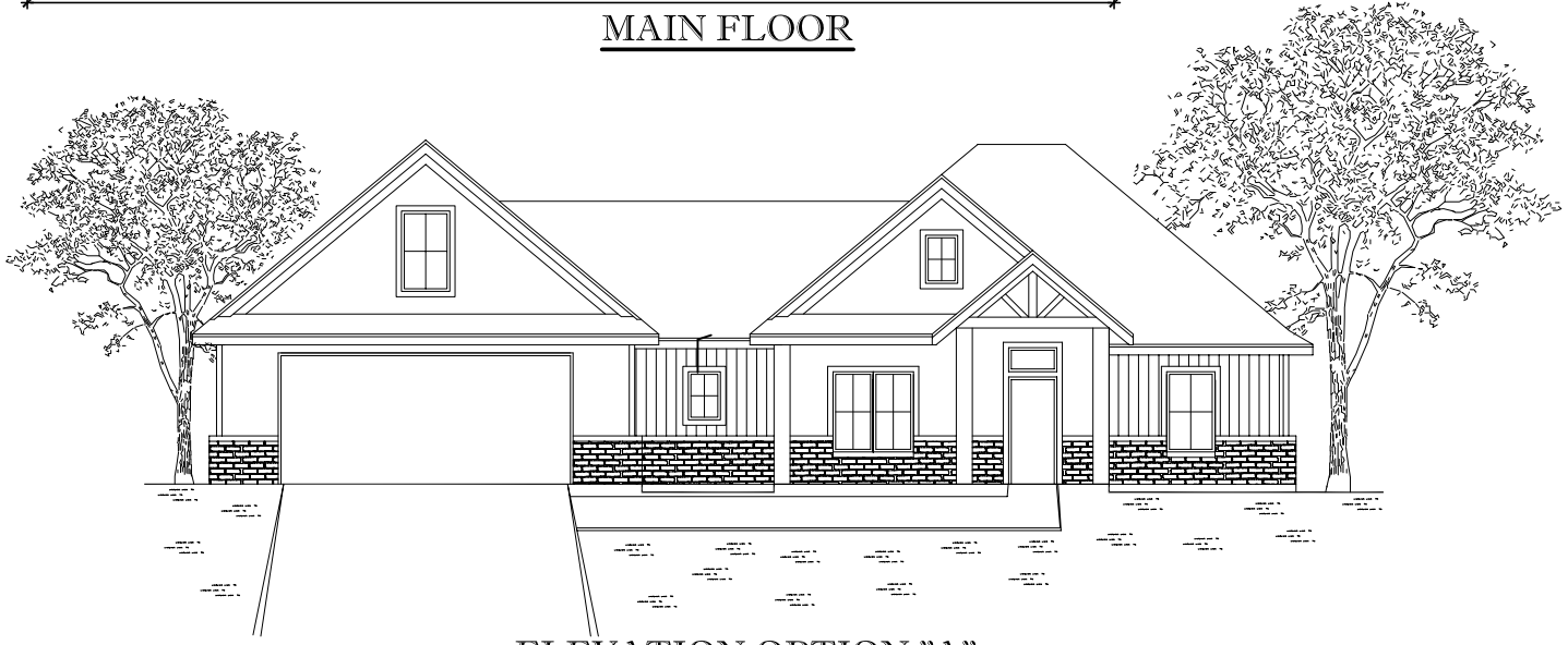
ELEVATION OPTION "A"

THE LANTANA 67'-7" W X 54'-3 1/2" D MAIN LIVING : 2079 SQFT OPT. BONUS : 361 SQFT TOTAL SLAB : 3188 S.F.