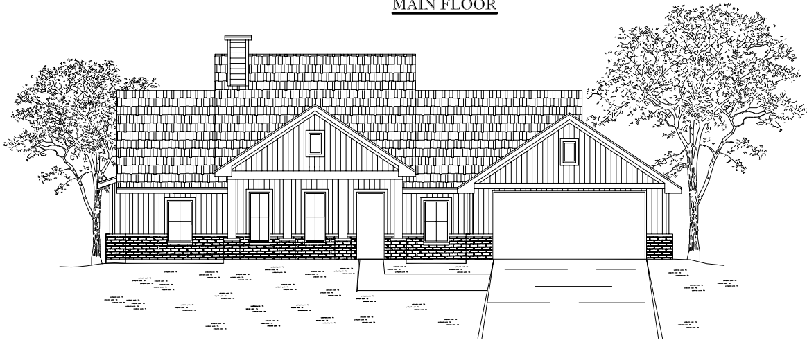
ELEVATION OPTION "A"